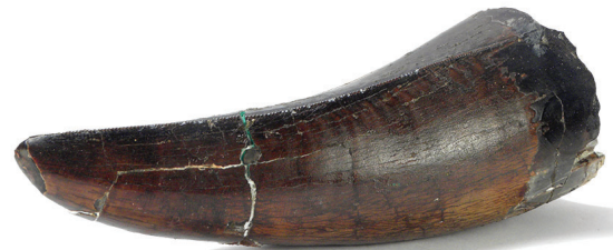
Tyrannosaurus rex tooth